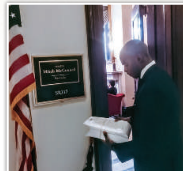
Petitions delivered to Senator Mitch McConnell from Kentucky.